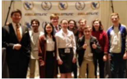
Model UN students attending EagleMUNC in Boston.

Cheverus Drama Society gives a preview showing of their entry to the One-Act Play Competition -- "Us & Them".