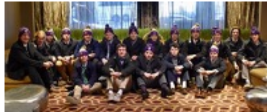
The 2018 Cheverus Hockey team visited Washington DC to play in the Damantha Catholic tournament.